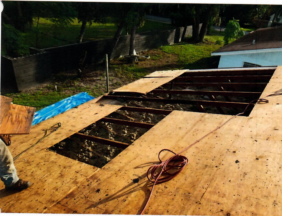
GORNTO LAKE APARTMENTS Karde Lane • Brandon, FL 33510